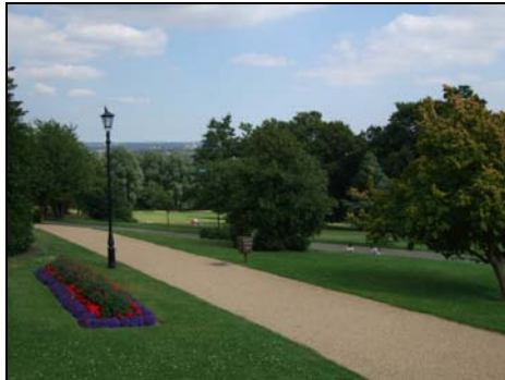
The South Font