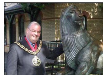
The Mayor tours the site

The Landscape Development project concluded in 2007 and a new park management plan was written at this time. In August 2008 a launch event celebrated the success of the project, representatives from the council and the HLF, the main funders, took a tour of the project.