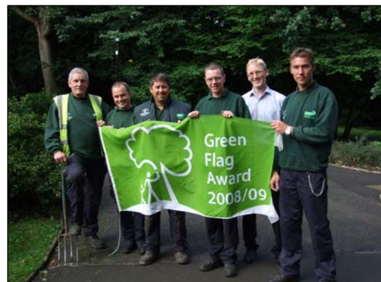
The successful team!

The site plans, species information, proposals and developments and a wide range of supplementary information can be found in the appendices. Due to the ever increasing file size of these documents, the appendices are available on request.